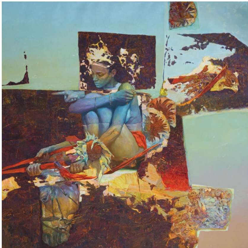
1 Untitled , oil on canvas, 24 x 24"