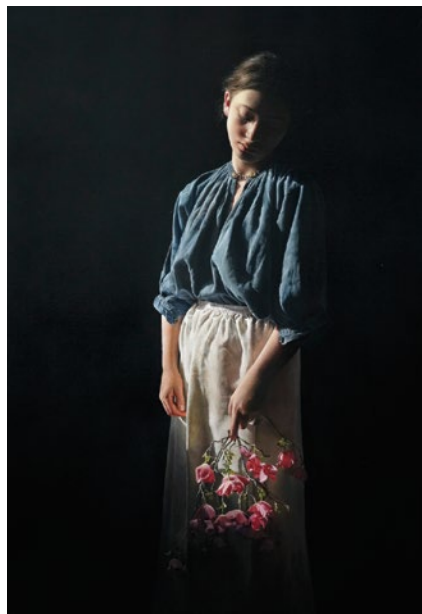
5 La Blouse Bleue , oil on canvas, 15½ x 12¼"