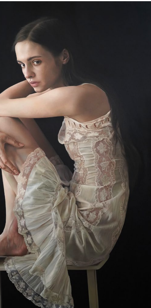
3 La Bague Verte , oil on canvas, 19 x 12½"